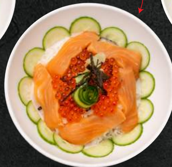
Salmon Avocado 1,980