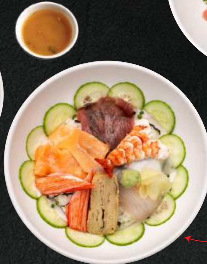
Tuna 1,980 Hokkaido Tuna | Salmon | Tamago | Cuttlefish | Prawn | Shiromi | Crab Stick