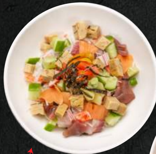
Tokyo Tuna | Salmon | Tamago | Crab Stick | Cucumber